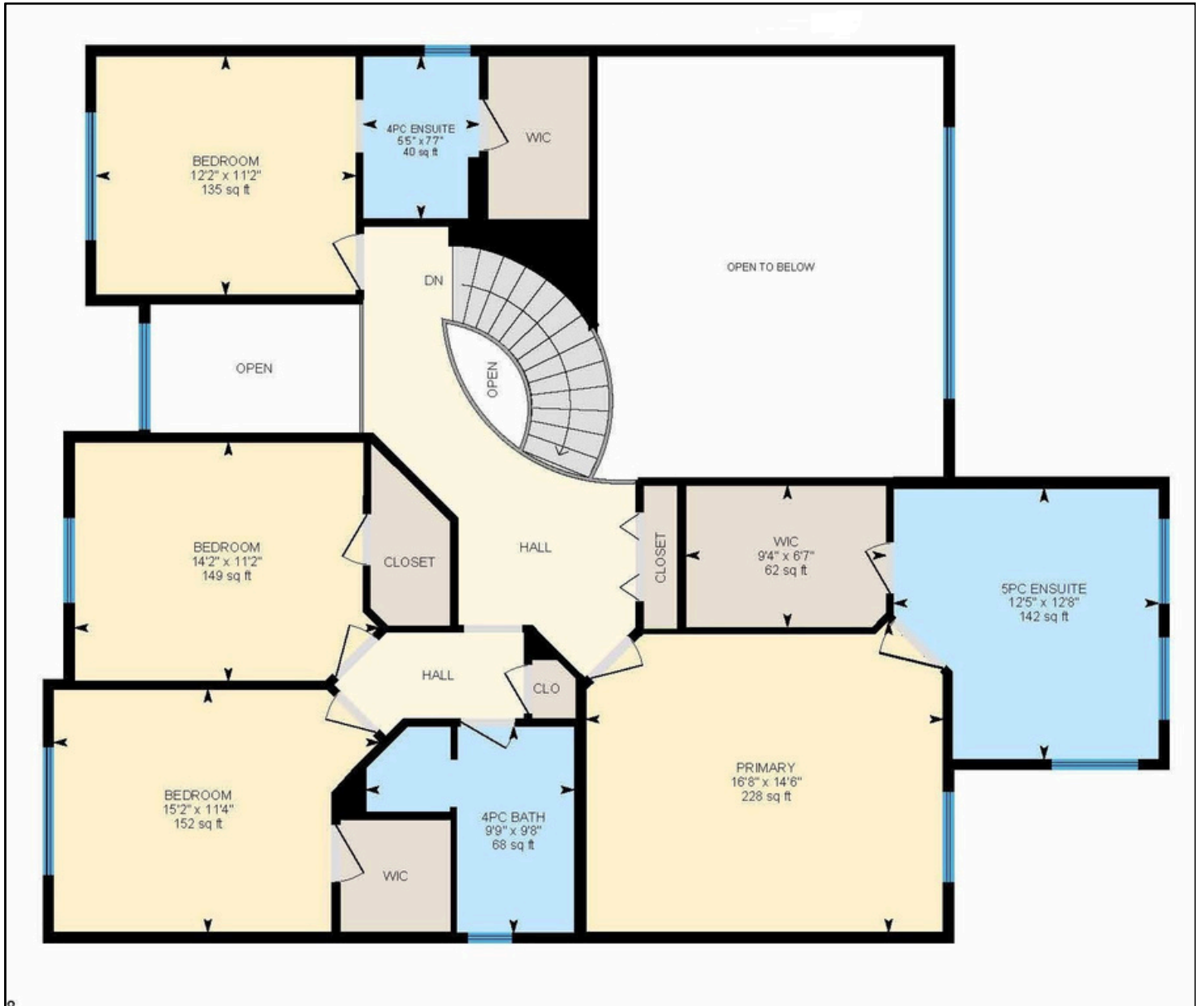
UPPER LEVEL 1,473 SF